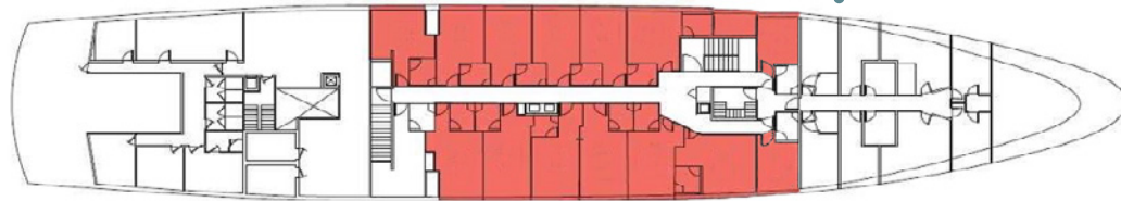
Upper Cabin Deck